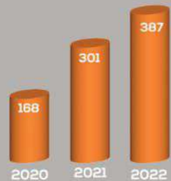
No. of offers