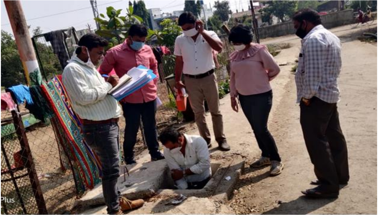
Third party Audit of Drain