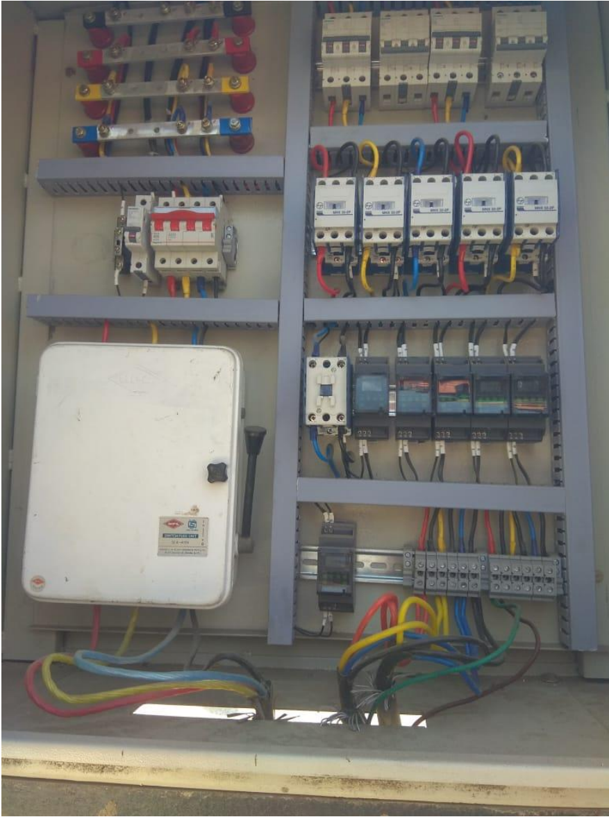
Proving & Erection of Energy Efficient LED street light with pole.