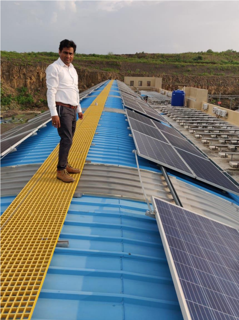
Proof checking of Design: Solar Panel Stand