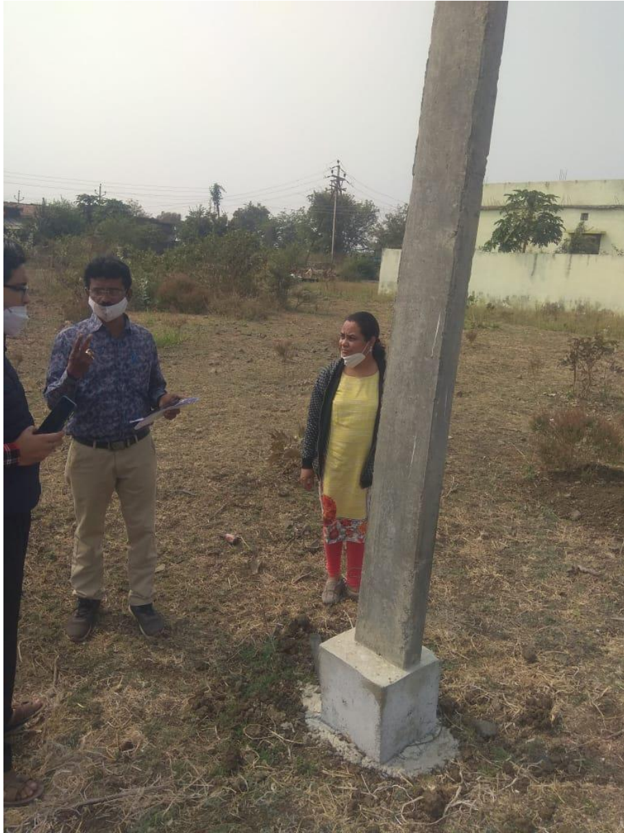
Proposed development of 316 Street light PSC pole, Karanja