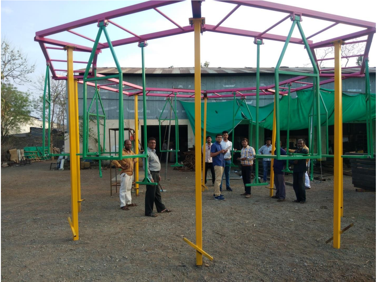
Inspection Carried at DSO Dhule