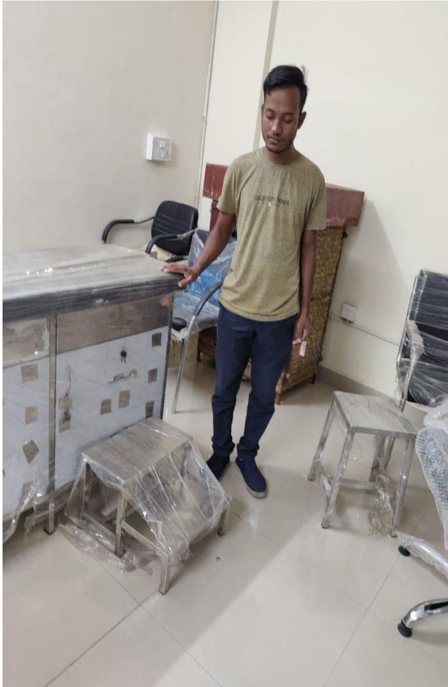
Furniture inspection: M/s Eros Industries, Nagpur