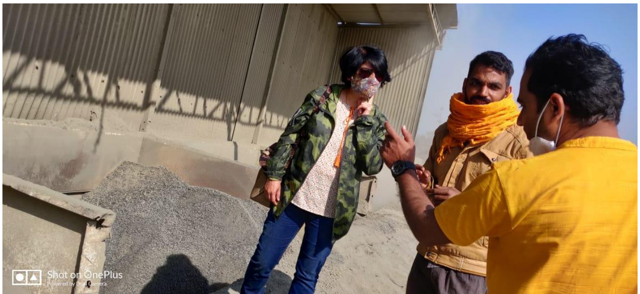
Hot Mix Plant, NEERI Project