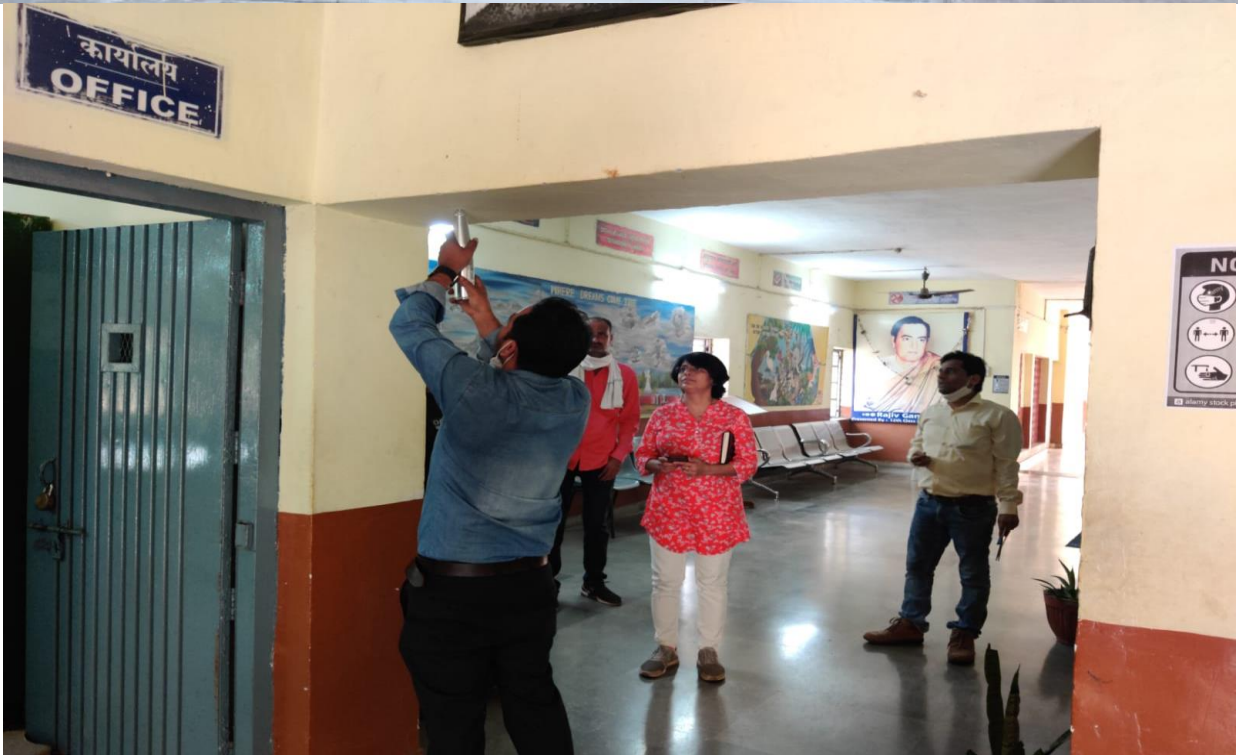
Structural Stability of Building