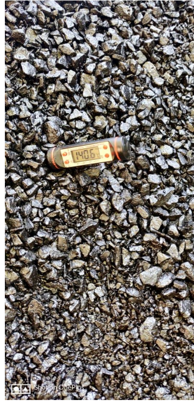
Third Party Audit of road at NEERI