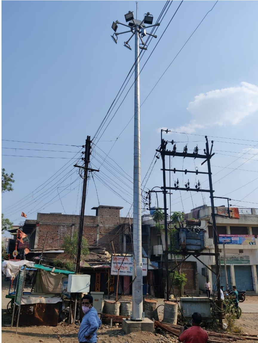
Providing & Fixing High Mast, Butibori