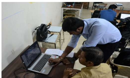
Snap from session venue – Stage – II

In the second stage, he covered the Hands-on session in which he taught and guided the participants to use GNU-radio software from the very initial stage. He taught how to install, identify tools, how to use and how to simulate. In this stage, the attendees enjoyed learning the software and simulating it. He taught to identify the efficiency, to reduce frequency, to analyze spectrums, techniques for modulation and demodulations e.g. PAM,PPM,BPSK,PWMetc.